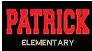
*Distressed (red letter w/khaki)