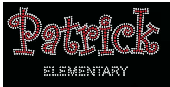
*Bling (red letter w/silver outline)

Student Name _____ Teacher/Grade _____ Parent Name _____ Phone _____